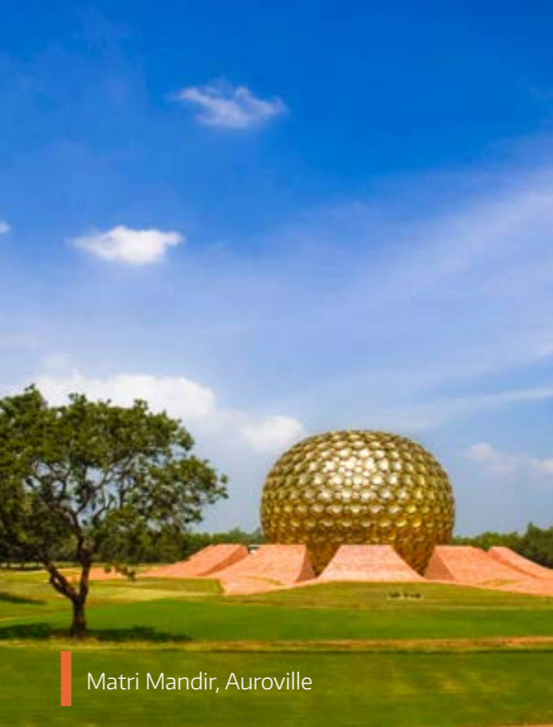
Matri Mandir, Auroville