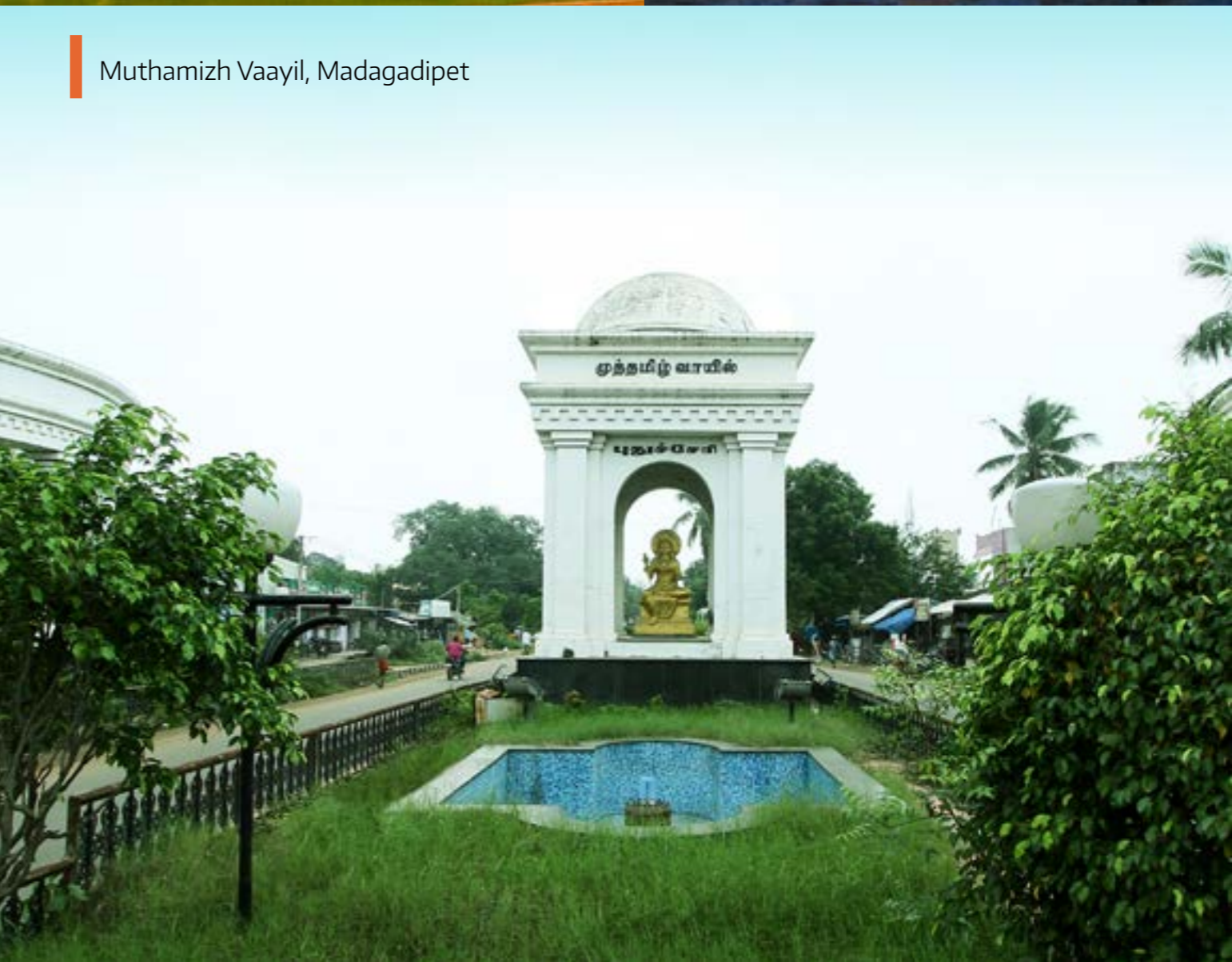
Muthamizh Vaayil, Madagadipet