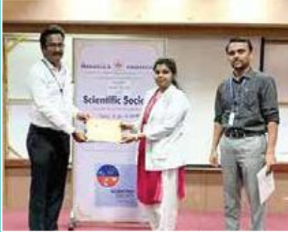
Article on Clinicopathological study of cutaneous horn in a tertiary care centre in South India.