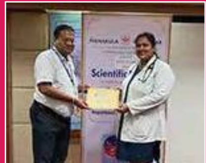
Case report on Isolated Myocysticercosis with solitary Neurocysticercosis.