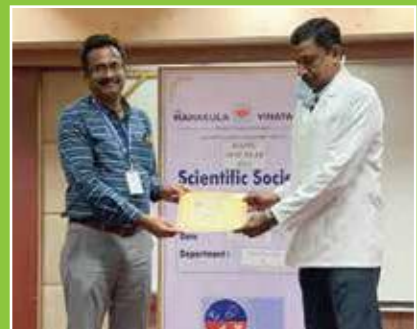
Case report on VATS Surgery for Thyrectomy