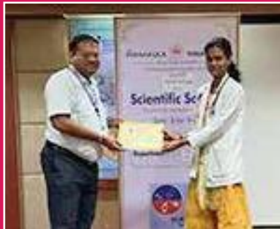
A study on clinical and immunological pattern of systemic lupus erythematosus patients in a tertiary care hospital- A Retrospective study