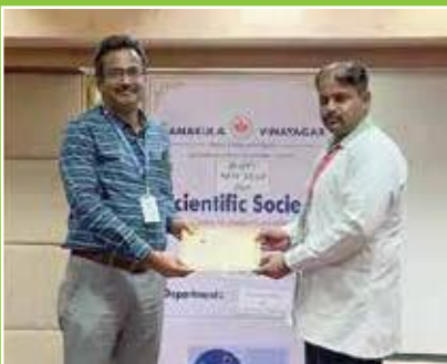
Case report on Anaesthesia for B/L TMJ Ankylosis