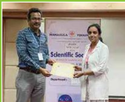
Case report on Successful Regional Anaesthesia technique in a patient with severe kyphoscoliosis