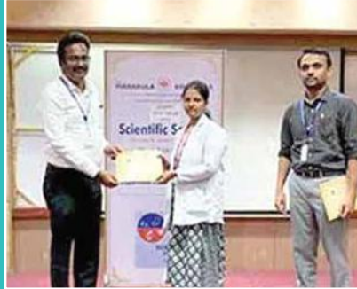
Article on Lichen sclerosus et atrophicus – Beyond the genitalia – A retrospective study