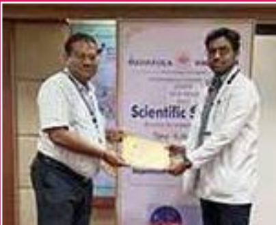
Article on Study of Correlation of Monocyte to HDL ratio with Carotid Artery Intima media thickness in acute ischemic stroke patients.