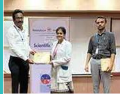
Article on Actinic cheilitis – A retrospective study of 26 patients in tertiary care hospital in South India